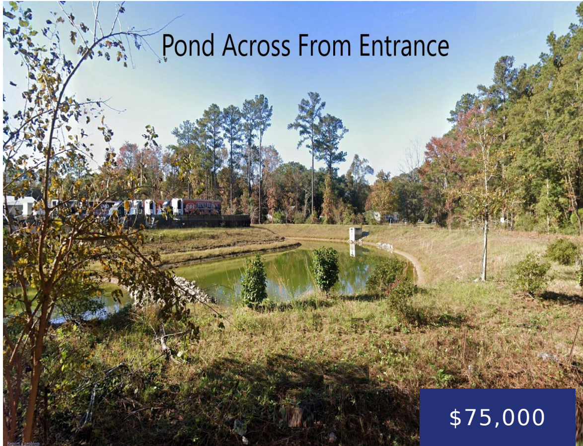
Pond Across From Entrance

168 Crosswatch Dr, Ladson, SC 29456, USA