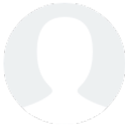
Lori Taylor Albers

This home has an open floor plan with a secondary bedroom and full bathroom on the first floor, great for visiting family or guests. The gourmet kitchen features a large center island, double ovens, gas cooktop with stainless hood all great for cooking large dinners and entertaining. The home has a formal dining room in [...]