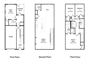
River's Edge Lot 6 Brookgreen