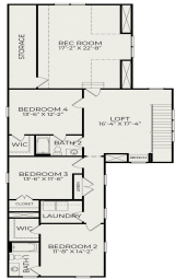
Lot 15 - West Marsh