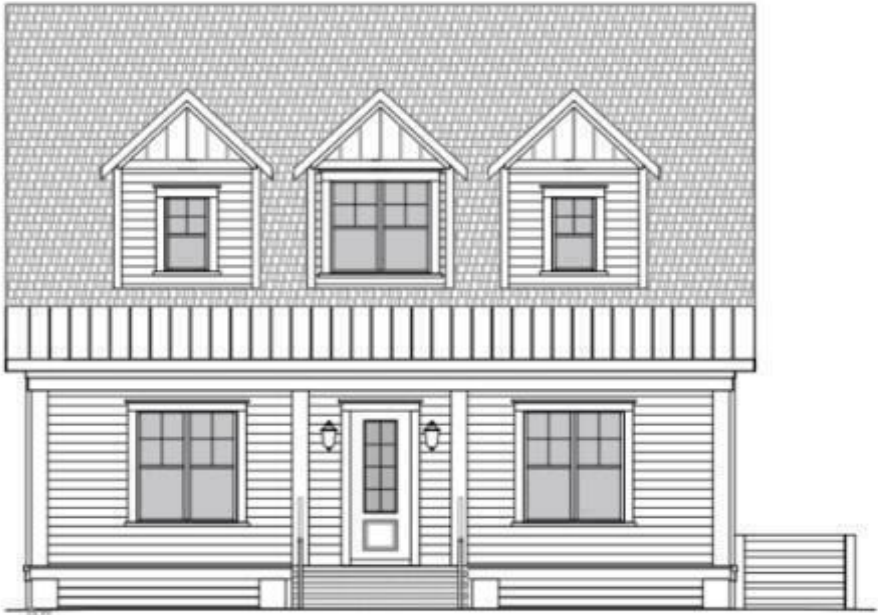
The Berkeley II