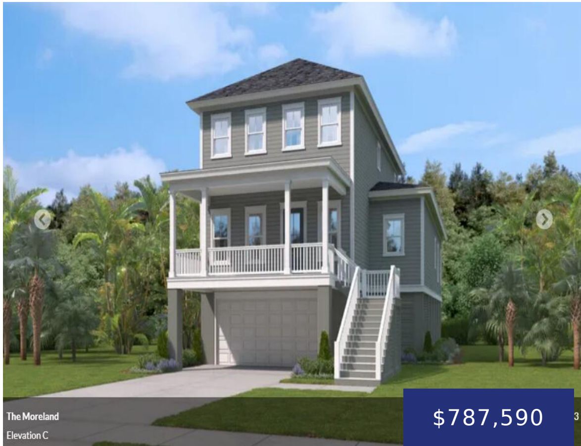
The Moreland Elevation C

2633 Maybank Hwy, Johns Island, SC 29455, USA