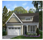
ELEVATION: BH (Decorative Letter of the Color) Color: See Sample Color: See Sample