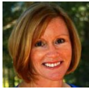
Stephanie Howard Elaine Brabham & Associates

MOTIVATED SELLERS! Looking for your own private retreat? This stunning property offers the peace and serenity you've been dreaming of! Nestled on 4.2 lushly landscaped acres, complete with marsh views and a tranquil pond, this home is your escape to nature. Plus, enjoy exclusive access to a community deepwater dock and boat landing on Bohicket [...]