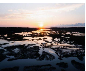
Custom plan in the Delinger's Point section of Carolina Park