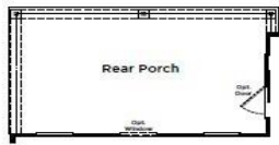
Opt. Rear Porch

Welcome to the St. Helena Plan June completion. This 2 story home has a flex room at the front of the home then opens up to kitchen with an island, dining space and large family space with electric fireplace and LVP floors on the first floor. Kitchen has 42” cabinets with quartz countertop and tile [...]