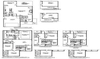
"ABBOTT" 2471 Sq. Ft.