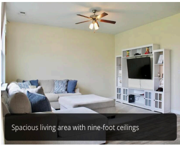
Spacious living area with nine-foot ceilings