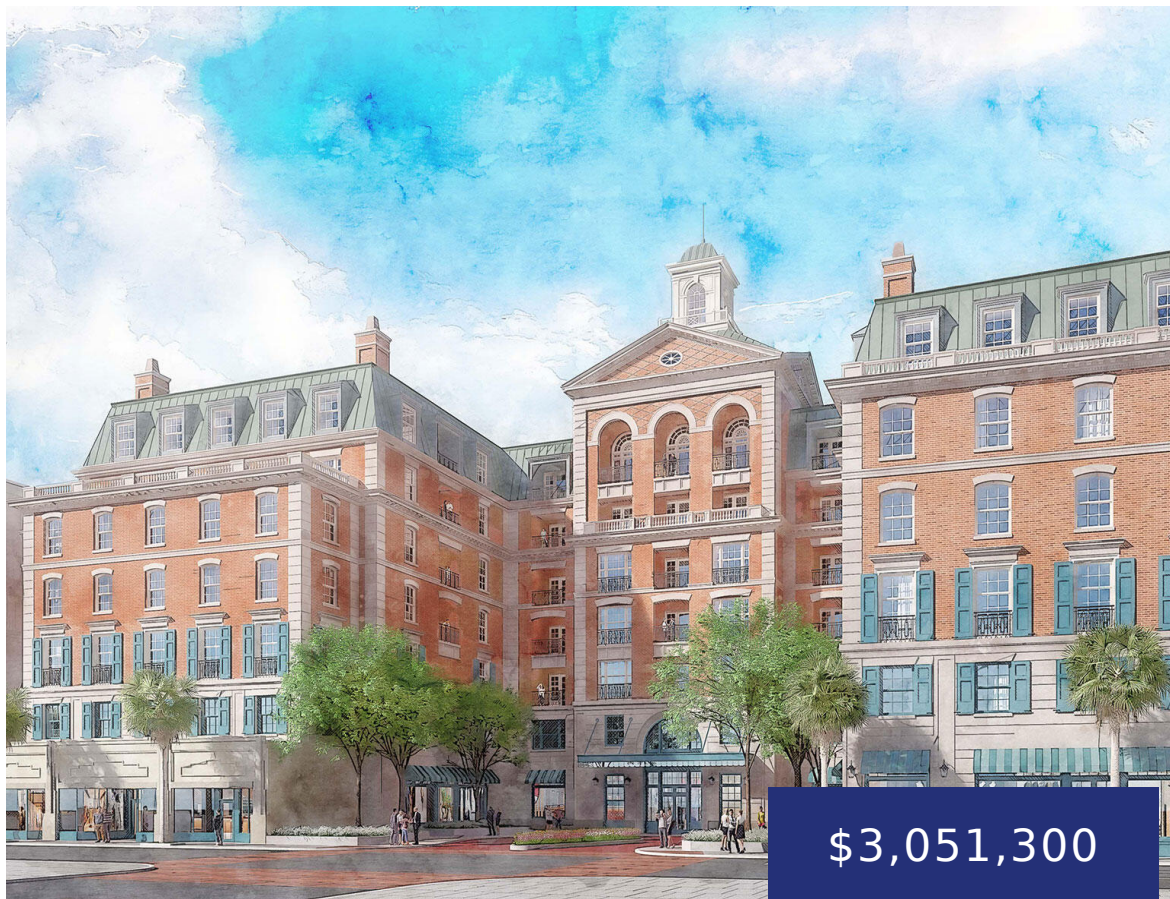
Menotti I TWO BEDROOM | THREE BATH | DEN | 2199 SQ. FEET