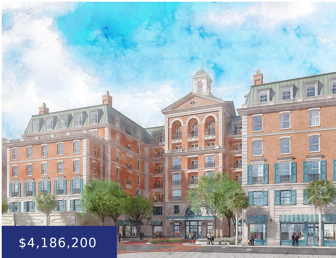
Poulnot I THREE BEDROOM | THREE BATHS | DEN | 2818 SQ. FEET