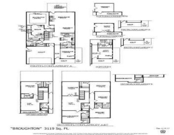
"BROUGHTON" 3119 Sq. Ft.

ESTIMATED CLOSING AUG/SEPT 2024! PRICE REFLECTS INCENTIVE, TIED TO USE OF SELLER PREFERRED LENDER/ATTORNEY PLUS Receive $5k in CLOSING COSTS! W/ SELLER PREFERRED LENDER/ATTORNEY. SEE ON SITE AGENT FOR DETAILS! Welcome to The Broughton! This 6 bed/4.5 bath home also has formal dining & a very spacious loft. Owner's Suite Downstairs. Spacious kitchen with ample [...]